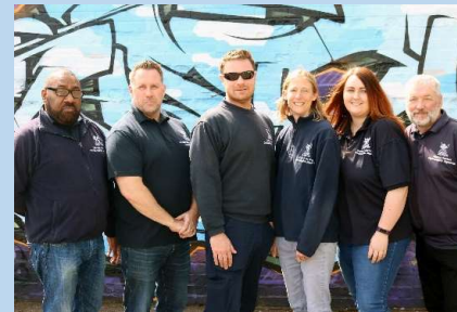
Outreach Services and the MDT