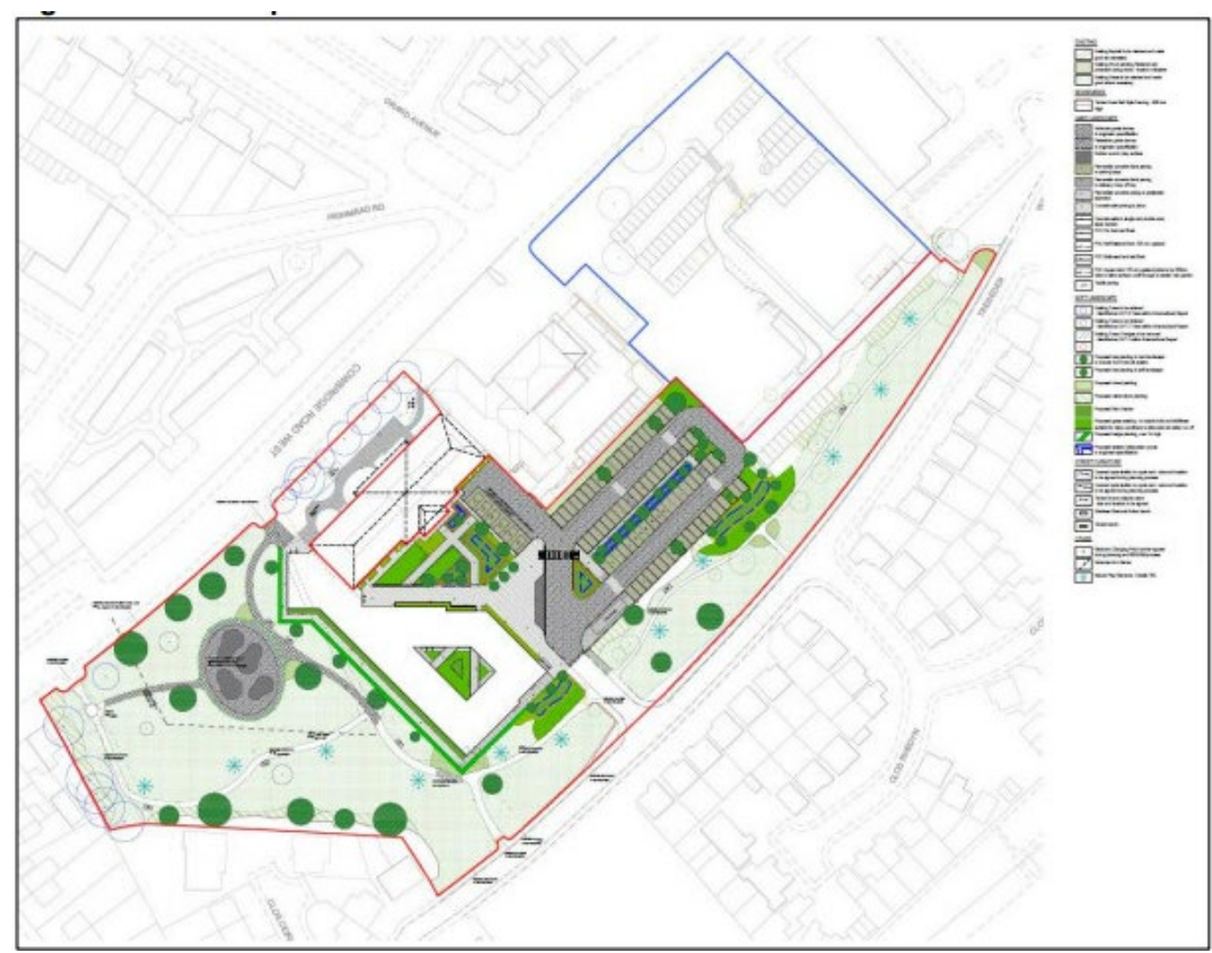
Figure 3: Indicative Site Layout