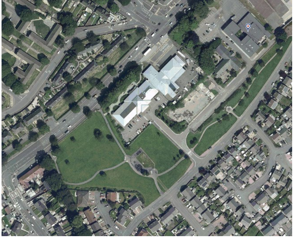
Figure 2: Aerial Photo of Site