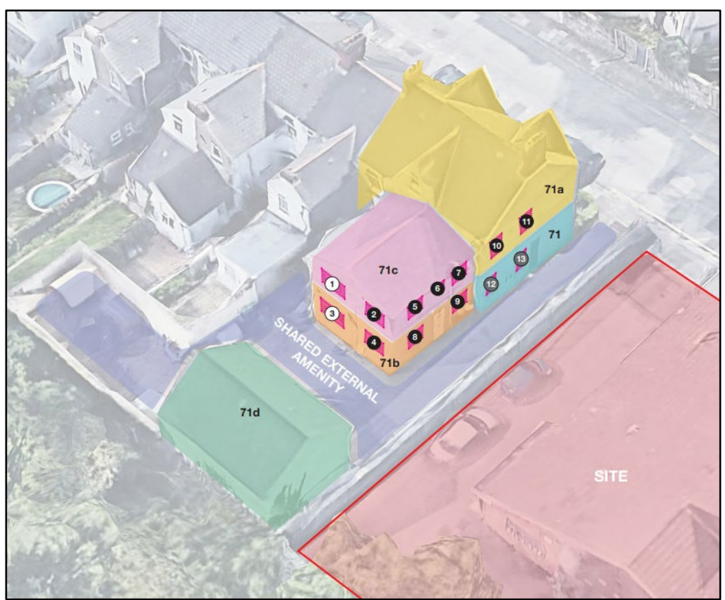
Figure 7: Adjacent Property (Five Residential Units)

9.24 To provide further context, the application site is bordered to the south by a residential property known as 71 Moorland Road, Splott. This property is split into five individual flats, with four of these being located within the original building, and one in an annex built to the rear. As a visual aide, each unit is shown in a different colour below, with the shared amenity space shown in purple, adjacent to the development site shown in red: