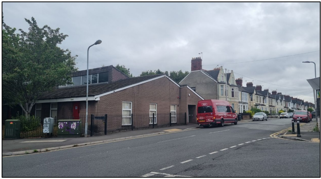
Figure 4: Existing Community Centre