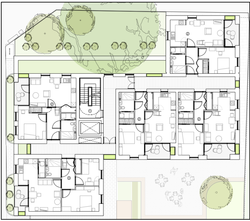
Figure 3: Proposed First and Second Floor Plan