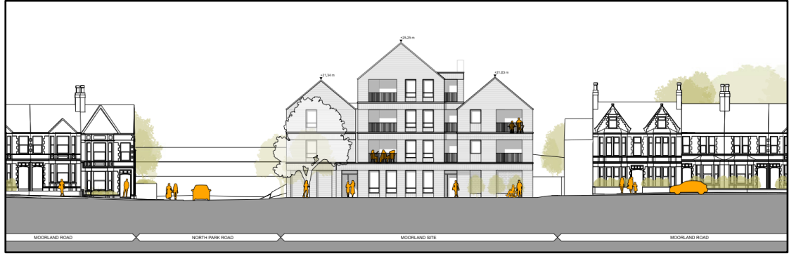
Figure 5: Proposed Elevations

and is orientated to create a feature-point sat on the corner plot between Moorland Road and North Park Road.