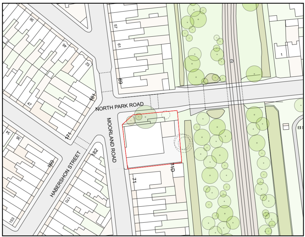
Figure 1: Site Location Plan

2.2 It is accessed from the western boundary along Moorland Road and currently comprises a brownfield site with a single storey, vaulted brown brick building surrounded by hardstanding. The site benefits from a small parking area to the south and has a managed area of grass and trees along the northern boundary.