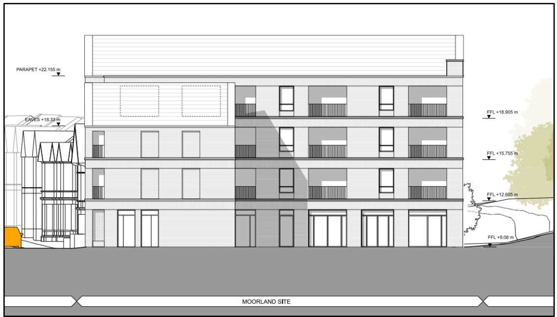
Figure 9: Elevation facing 71 Moorland Road