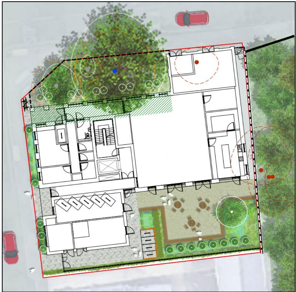
Figure 12: Landscape Proposals