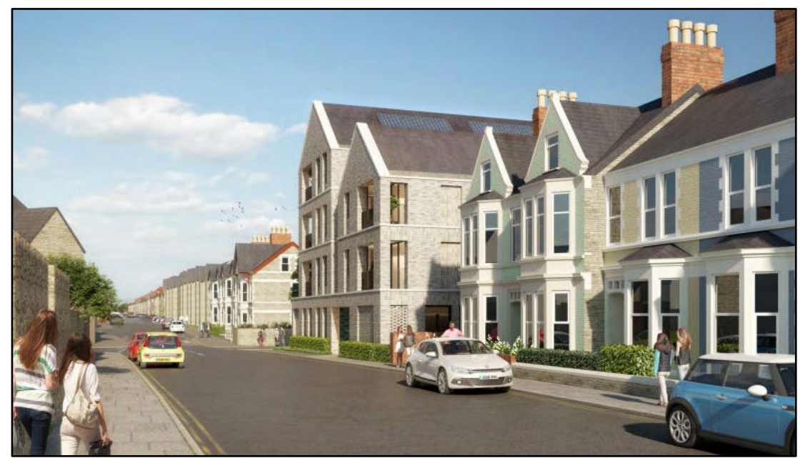
Figure 6: Illustrative Street View