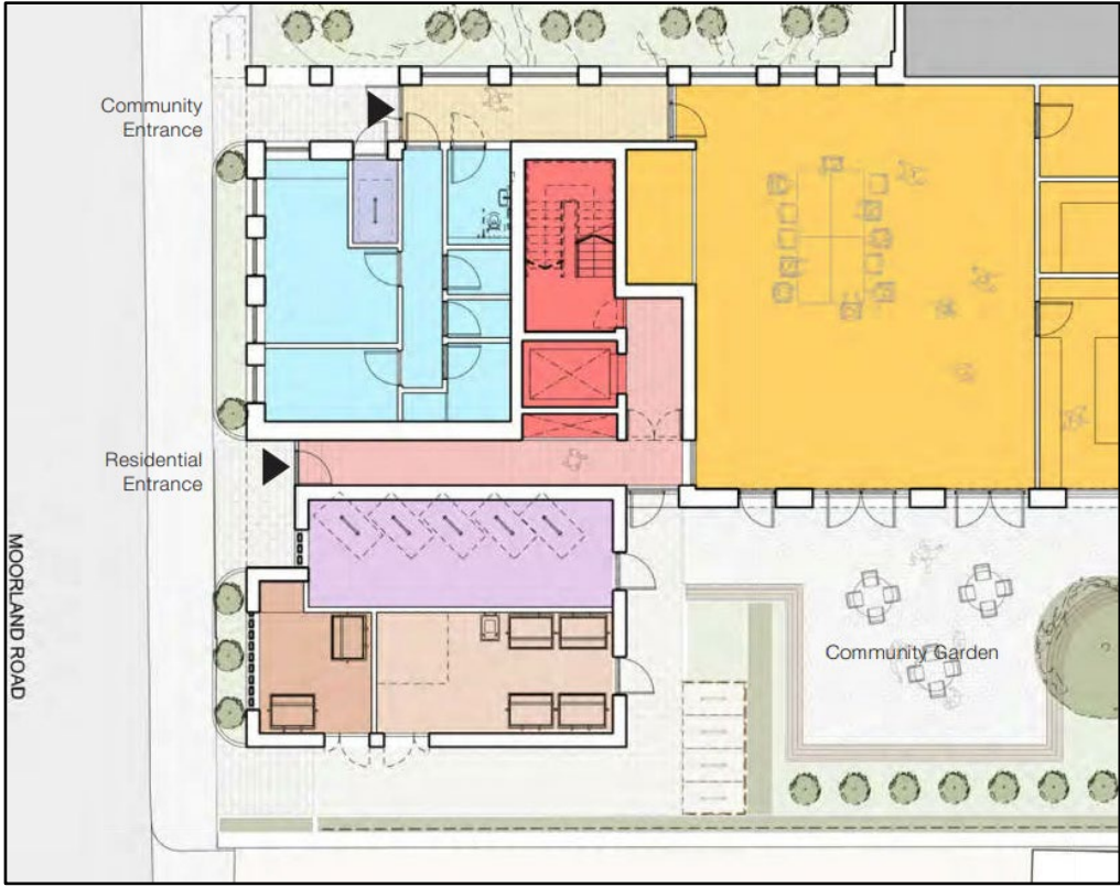
Figure 10: Cycle Parking Provision

9.48 It is noted that the applicant has provided more cycle parking than the minimum requirements which is welcomed and encouraged (also making the accommodation adaptable). Whilst this is noted, further detail is required in respect of visitor access to the cycle storage area to the south of the building, to the immediate west of the communal garden area. Concerns are raised that the spaces may be compromised if staff members are unavailable to provide access and therefore it is requested that a condition is imposed which requires the submission of further detail showing the provision of cycle parking spaces and appropriate access to them, prior to the above-ground development commencing. Subject to the inclusion of the recommended planning condition, the scheme is considered to be acceptable in this regard.