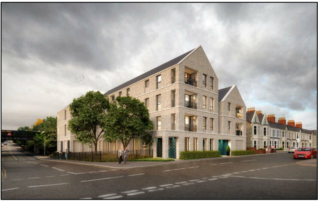
Figure 2: Illustrative Drawing

3.2 The building proposed is split into three elements, each with a pitched roof gable fronting Moorland Road. The central, four storey element of the proposal will reach a height of 25.25 metres, whilst the other three storey elements positioned to the north and south of the central element will reach a height of 21.34 metres and 21.63 metres respectively.