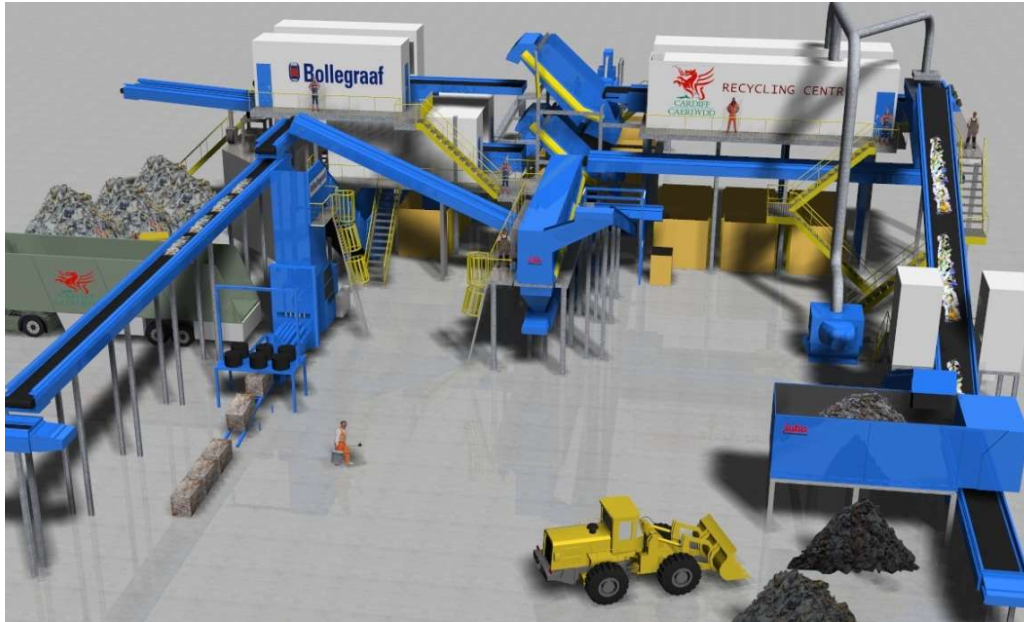
Picture 1- artist's impression of the MRF

Cardiff's co-mingled (mixed) recyclable material is delivered to our in house MRF (Materials Recycling Facility). The MRF receives and segregates all material, through a mixture of automated and manual sorting.