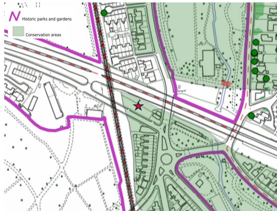
Figure 2: Conservation Area / Historic Park and Garden Context