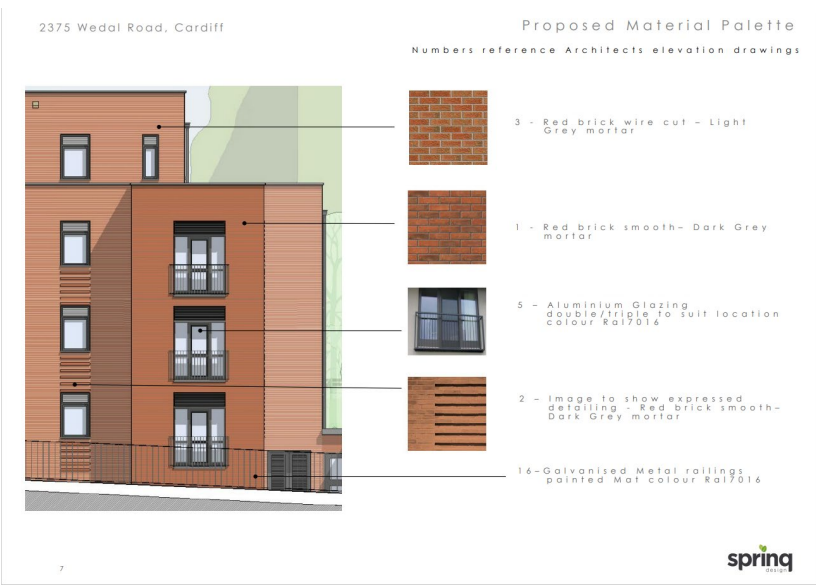
Figure 8: Materials Palette

8.8 The modern flat roof approach to the building design is considered to be appropriate for this context, though the use of high quality external finishes will be important to ensure an end product that is appropriate for this location. Architecturally, the modern flat roof approach, which is set to the rear and moves away from the principal terrace of properties fronting onto the junction, ensures the building will be visually distinct from these traditional gable-fronted properties.