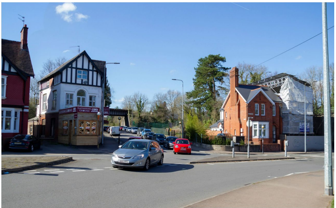
Figure 3: Looking West Up Wedal Road