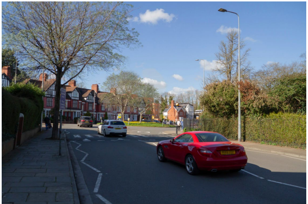
Figure 11: Ninian Road Viewpoint

8.22 Beyond this, i.e. within the park, views in winter will be partially obscured by the mature trees in the area, and much more so in spring, summer and early autumn. Cadw are satisfied that the setting impact upon the registered park will be negligible.