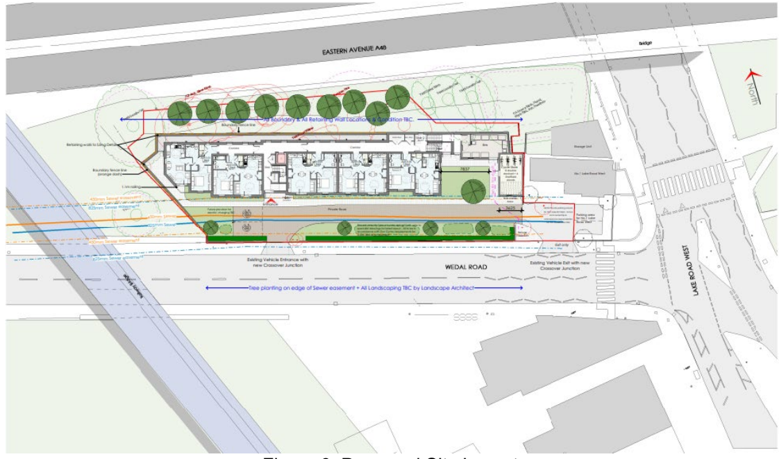
Figure 6: Proposed Site Layout