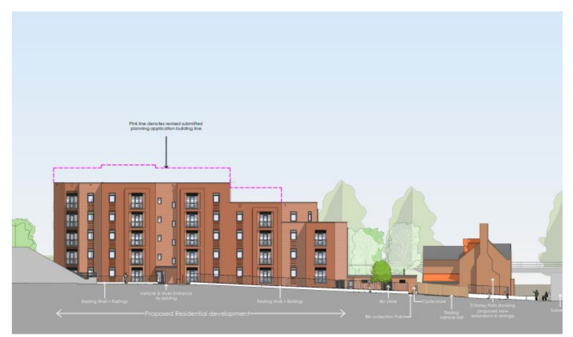
Figure 4: Proposed South Elevation

2.1 This application initially sought full planning permission for a 3-6 storey building comprising 27 no. affordable apartments (25 no. 1 bed and 2 no. 2 beds) and associated works. This has subsequently been amended to a 3-5 storey building comprising 23 no. 1 bedroom apartments (see paragraph 2.18).