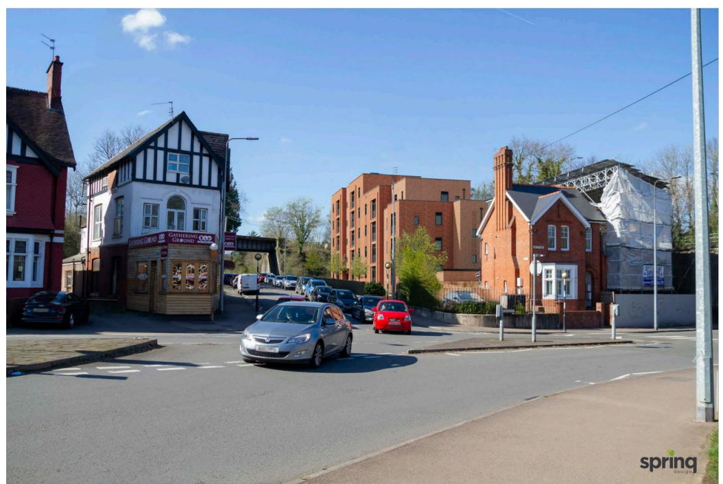
Figure 9: Wedal Road Viewpoint