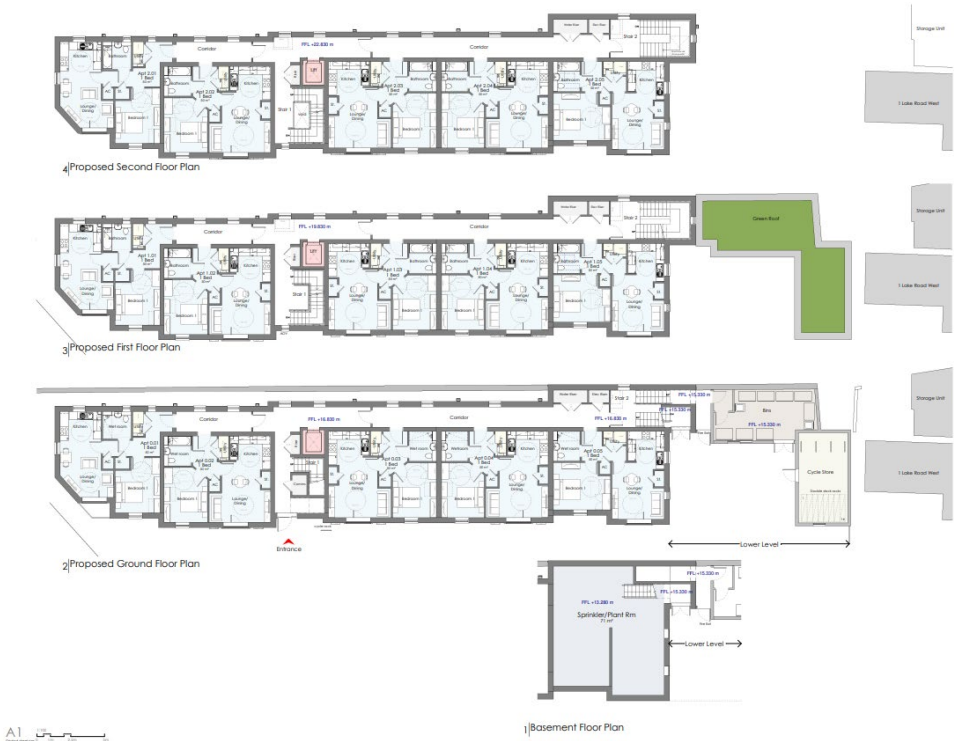
Figure 5: Floor Plans (Basement – 2nd)

2.2 All apartments are to be social rented and managed by the applicant, a Registered Social Landlord.