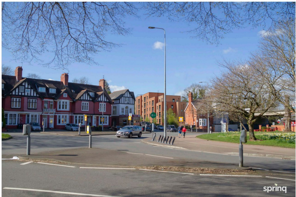
Figure 10: Fairoak Road Viewpoint