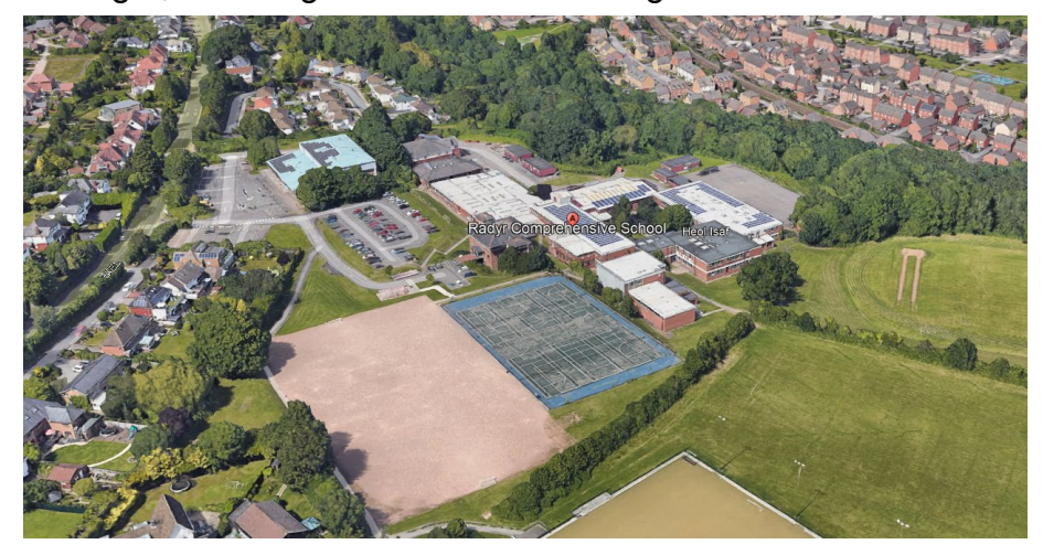
Fig. 1 – View from the South West across the School Campus

2.1 The application site comprises part of the existing Radyr Comprehensive School site which is located to the south east boundary of Radyr a suburban village to the north east of the City. The wider school site extends to approximately 14ha including playing fields to the south east. The northern part of the wider site incorporates a range of existing buildings of single and two stories in height, including demountable buildings.