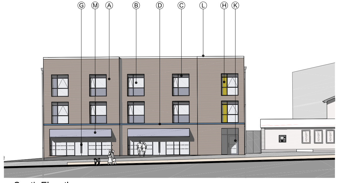
2nd V 1st V